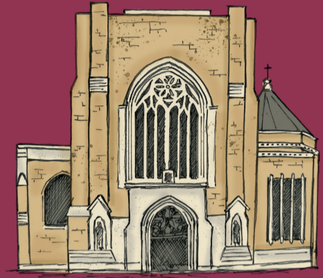
St George's Cathedral

We are delighted to launch a national Catholic schools Art Competition in the lead-up to Adoremus this October, organised by the Bishops' Conference of England and Wales. A key feature of Adoremus will be the Blessed Sacrament prayerfully processed from Southwark Cathedral to Westminster Cathedral, so we invite young people to reflect creatively on themes such as the Blessed Sacrament, the presence of Jesus, and the beauty of our cathedrals.